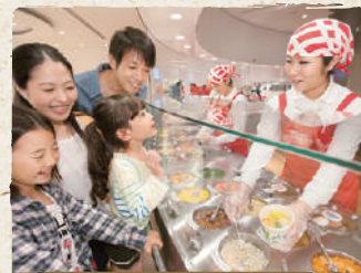
3 Cupnoodles Museum

Yokohama Landmark Tower is the 4th tallest structure in entire Japan. The deck of landmark tower offers an amazing view of Mount Fuji.