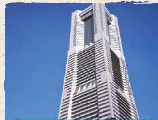
2 Landmark tower

Minato Mirai is a Modern seaside area with major tourist sights of Yokohama City with number of restaurants and shops. The night view of Minato Mirai is astonishingly gorgeous.