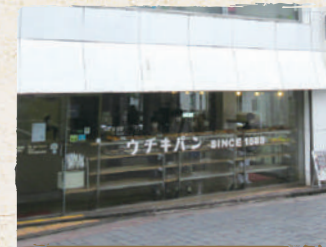
5 Uchiki bread

Kirin is a popular company that has a long history of beer in Japan. The Kirin Yokohama beer factory offers free tours of its large brewery as well as beer tasting bar for the visitors.