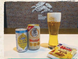
4 Kirin Brewery Yokohama Factory

The Cup Noodle Museum is a popular food museum known for its instant Ramen noodles. The museum exhibits the history of Instant Ramen and the Visitors here can even make their own DIY cup noodles and carry back with them.