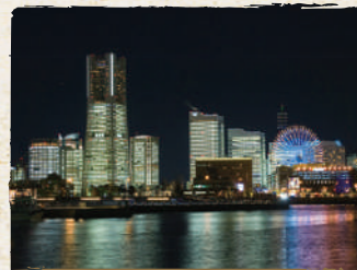
1 Night view of Minatomirai

Yokohama is a leading tourism and leisure destination of Japan. It is known for its exotic ambiance, with an amalgamation of the historic and the contemporary. This photogenic city attracts people of all interests.