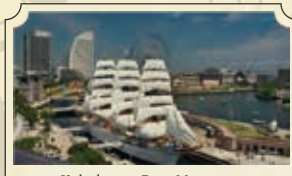
Yokohama Port Museum