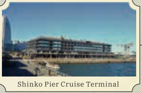
Shinko Pier Cruise Terminal